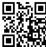
QR Code - Pow Wow registration site